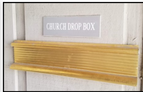
Secretary's locked office.